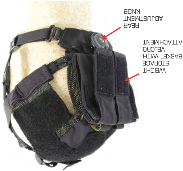
Rear ISO View