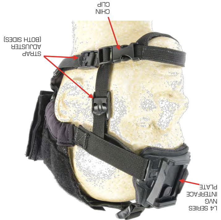
Front ISO View