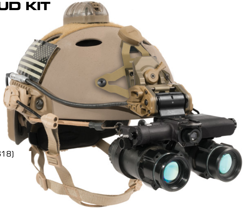
(SHOWN:DPAM KIT- (62100G18)