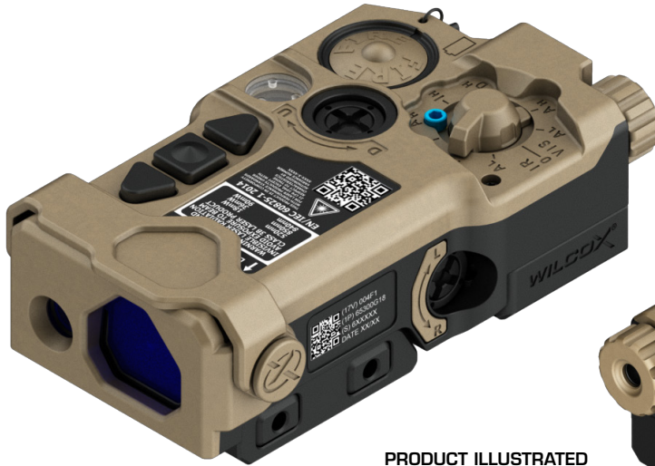
PRODUCT ILLUSTRATED IN COYOTE (-C) WITH LASER SAFETY HOOD OPEN

RUGGEDIZED AIMING/ILLUMINATION DEVICE - ENHANCED - HIGH POWER